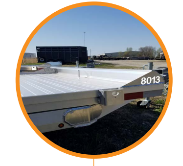
Air dam with Aluminum winch tie Floor