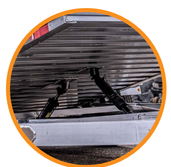
Adjustable Air Shock