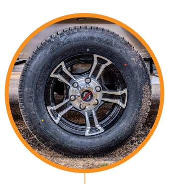
Torsion Axle with Aluminum Wheels