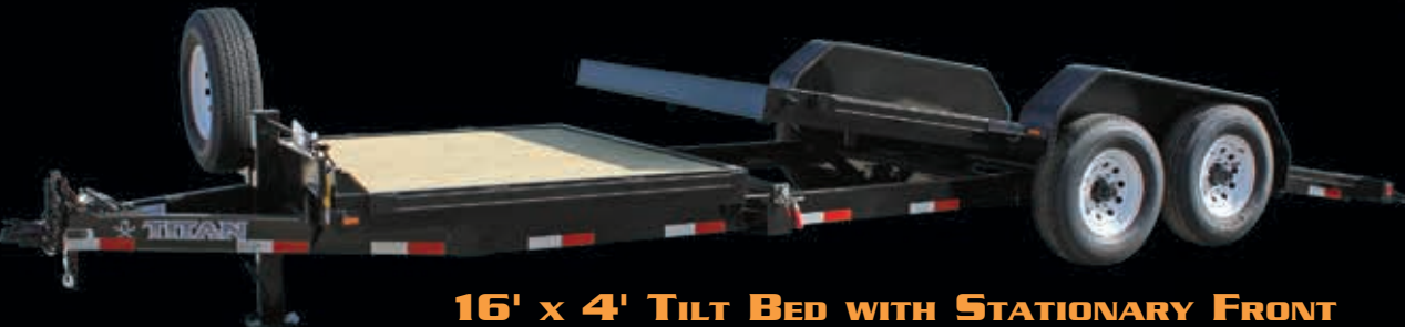
16' x 4' TILT BED WITH STATIONARY FRONT