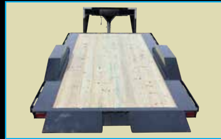
102" WIDE TILT DECK WITH DRIVE OVER FENDERS