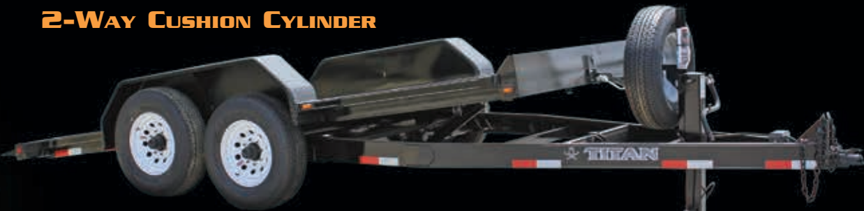
16' TILT DECK TRAILER