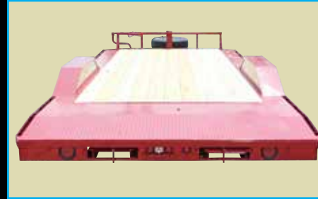
2' DOVETAIL WITH SLIDE IN RAMPs