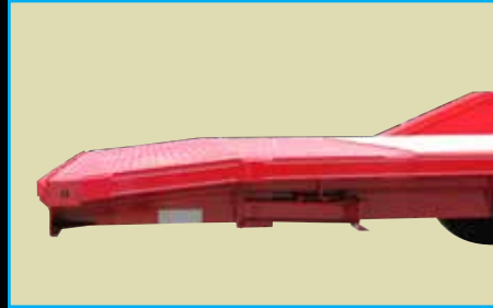
2' DOVETAIL WITH LOAD JACKS