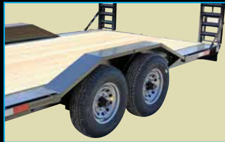
DRIVE OVER FENDERS WITH 102 INCH WIDE DECK