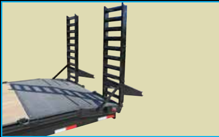
20" WIDE SPRING ASSIST RAMP WITH STATIONARY LOAD JACKS