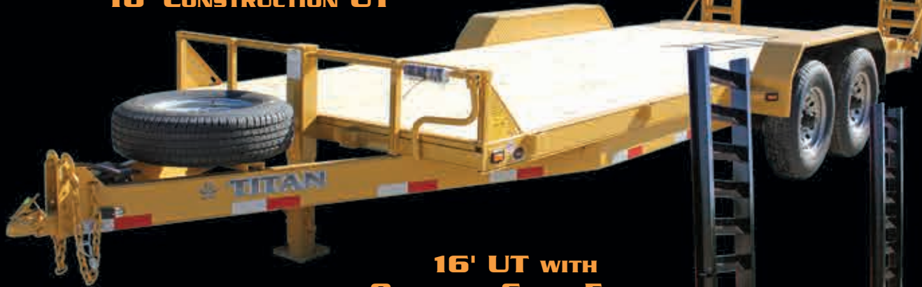
16' UT WITH OPTIONAL STEEL FLOOR