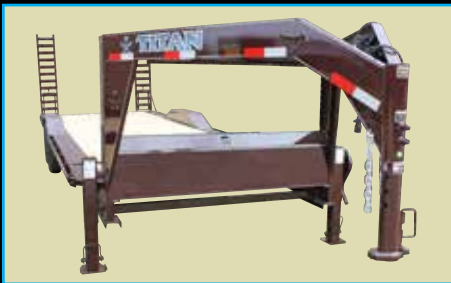
DOUBLE JACKS AND TOOL BOX