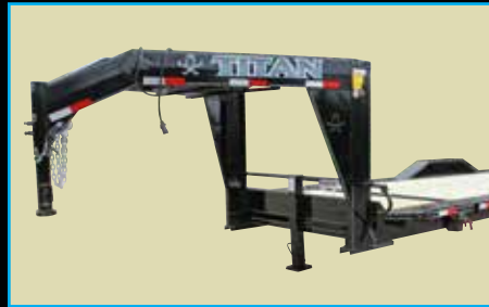
20' x 4' GOOSENECK TILT SHOWN WITH OPTIONAL 102" WIDE DECK