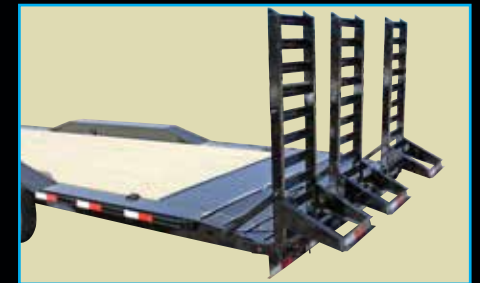
THREE 20" RAMPS WITH STATIONARY LOAD JACKS AND 2' DOVETAIL