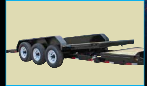
4' x 20' TRIPLE AXLE BH TILT