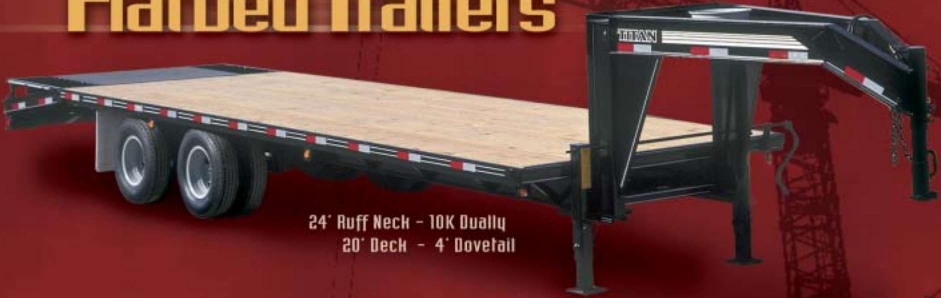
24' Ruff Neck - 10K Dually 20' Deck - 4' Dovetail