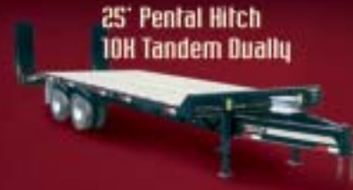
25' Pentax Hitch 10K Tandem Dually

19# I Beam • Treated 2" x 8" Floor Boards • 2-5/16" Gooseneck Coupler • 7-Prong Heavy Cord Battery Box with Battery & Breakaway Switch • Reflective Tape on Trailers over 10,000# GVWR Winch Plate and Battery Mount • Sealed Beam Recessed L.E.D. Lights • Electric Brakes on all 4 Wheels • 3" Channel Crossmembers on 16" Centers • Coated Inner Frame Under Floor Stem Made with Same I-Beam as Frame • Spare Wheel