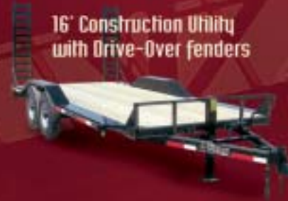
16' Construction Utility with Drive-Over fenders