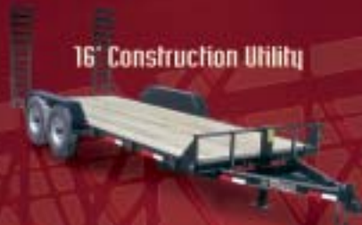
16' Construction Utility