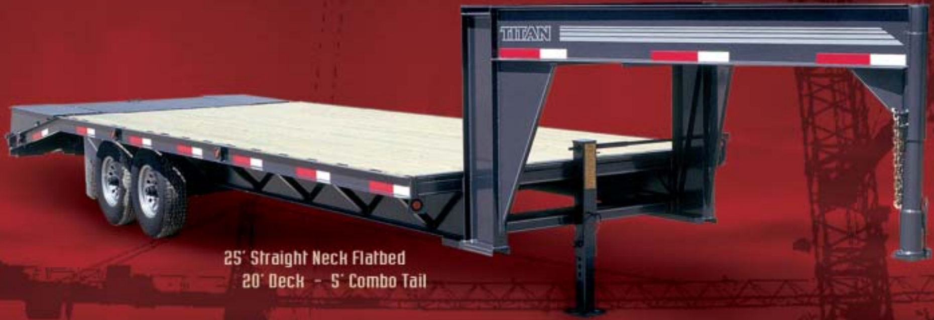
25' Straight Neck Flatbed 20' Deck - 5' Combo Tail