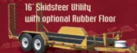
16' Skidsteer Utility with optional Rubber Floor