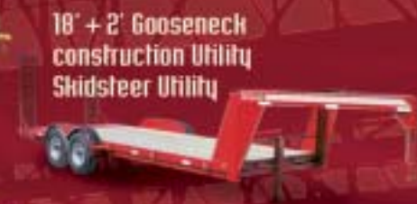
18' + 2' Gooseneck construction Utility Skidsteer Utility

Pictures may include optional equipment. Dimensions and weights are approximate and may vary slightly by model in this brochure. Titan Trailers reserves the right to make changes to trailers without notice.