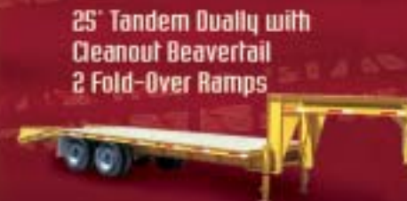
25' Tandem Dually with Cleanout Beaver tail 2 Fold-Over Ramps