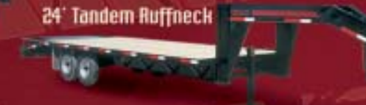
24' Tandem Ruffneck