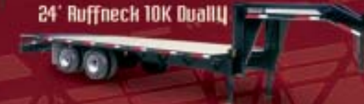
24' Ruffneck 10K Dually