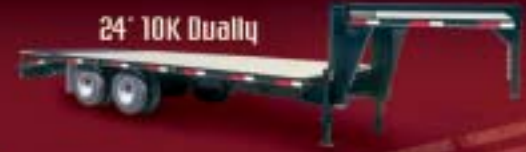
24' 10K Dually